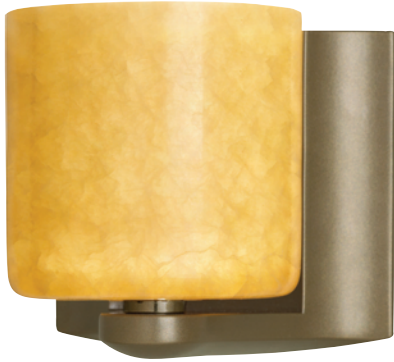
Shown approximately 45% actual size.