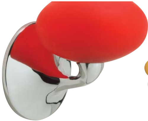
RED THREE-QUARTER VIEW Shown approximately 30% actual size.